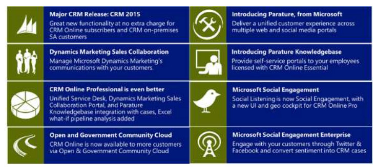
*Includes Autumn Release 2014 and Spring Release 2015